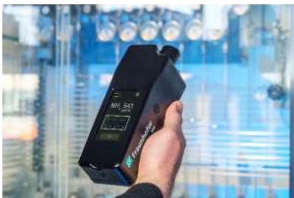
Fig. 3 Hydrogen can be stored and transported in the form of ammonia ( \text{NH}_3 ). The laser spectrometer from Fraunhofer IPM absorbs the wavelength of ammonia, so it reacts immediately. The system then shows the result on a display.