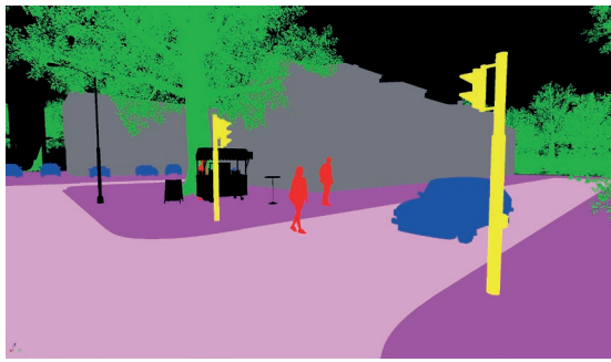
Rendered image (left) and automatically annotated image (right)